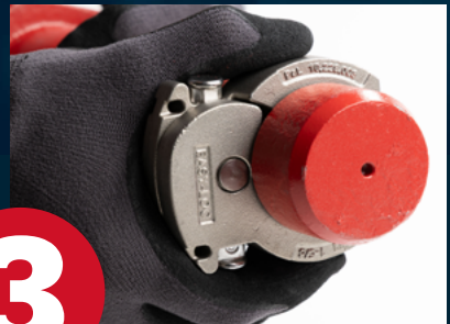
Push collar onto bolt